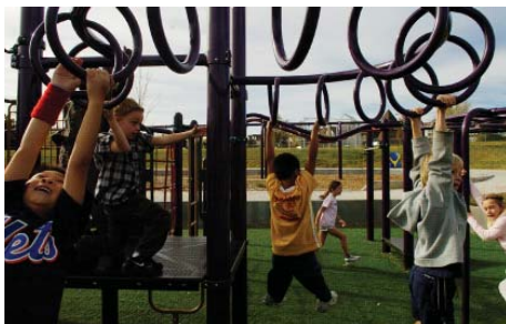
Students play on primary play equipment at Southmoor Elementary School

The quality of children's environments has come into question in response to the recent childhood obesity epidemic. Designing safe outdoor play environments that support children's physical activity provides a potential mechanism for counteracting childhood obesity. Since 1998, the Learning Landscape Initiative has transformed 46 neglected Denver elementary school playgrounds into attractive and safe multi-use resources that encourage outdoor play and learning and provide op-