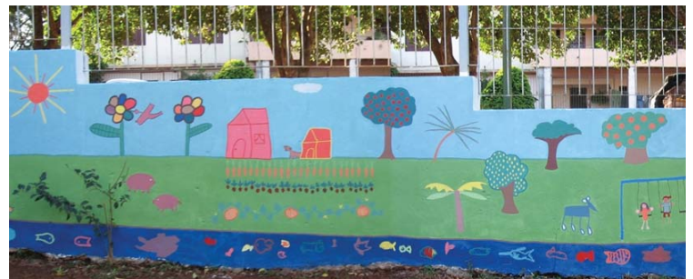
The finished mural painted by children.

Through my experiences, I have learned first hand that in order for community development to continue and develop a life of its