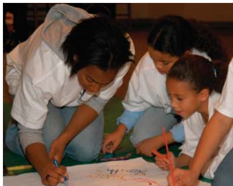
The "Express Yourself" Lounge at the Youth Speak Event.

The committee is working with key stakeholders from across Denver to implement this Initiative, including the Honorable Mayor John Hickenlooper, Denver's School Superintendent, Michael Bennet, and other Denver leaders. By forming a broad-based alliance across public and private partners, the