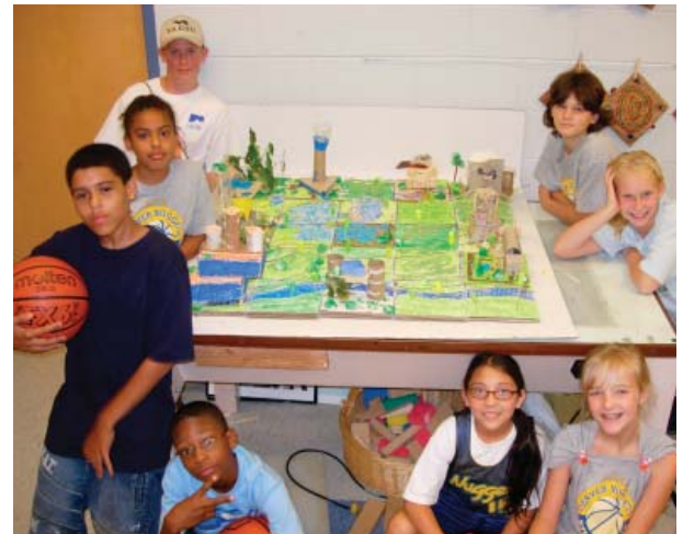
Presenting their final project.