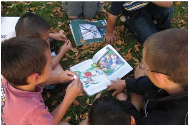
An undergraduate reading a nature-focused story with children at Creekside.

This semester we embarked on a participatory project, pairing undergraduate students with elementary school children at Creekside Elementary School in Boulder. This project was part of a